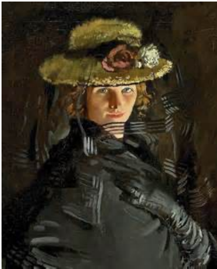
"Portrait of Grace" by Sir William Orpen (1878-1931)